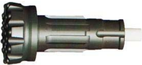
Specification Of Products:SD8