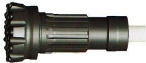
Specification Of Products:QL80