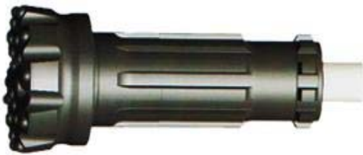
Specification Of Products:MD85 DHD380 COP84