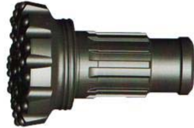
Specification Of Products:M80A